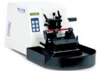
CUT 5062 – semi automatic model