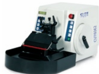
CUT 6062 – fully automatic model

(Specifications are subject to change without notice)